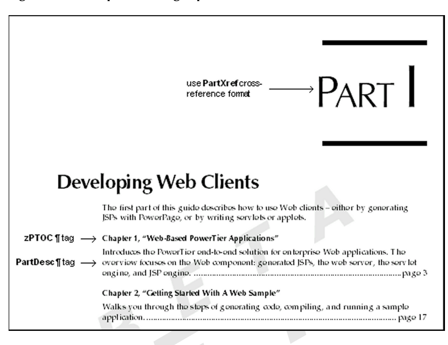
Figure 2. Sample Part Page (partial)